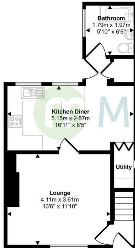
Ground Floor Approx 37 sq m / 401 sq ft

Approx Gross Internal Area 69 sq m / 747 sq ft